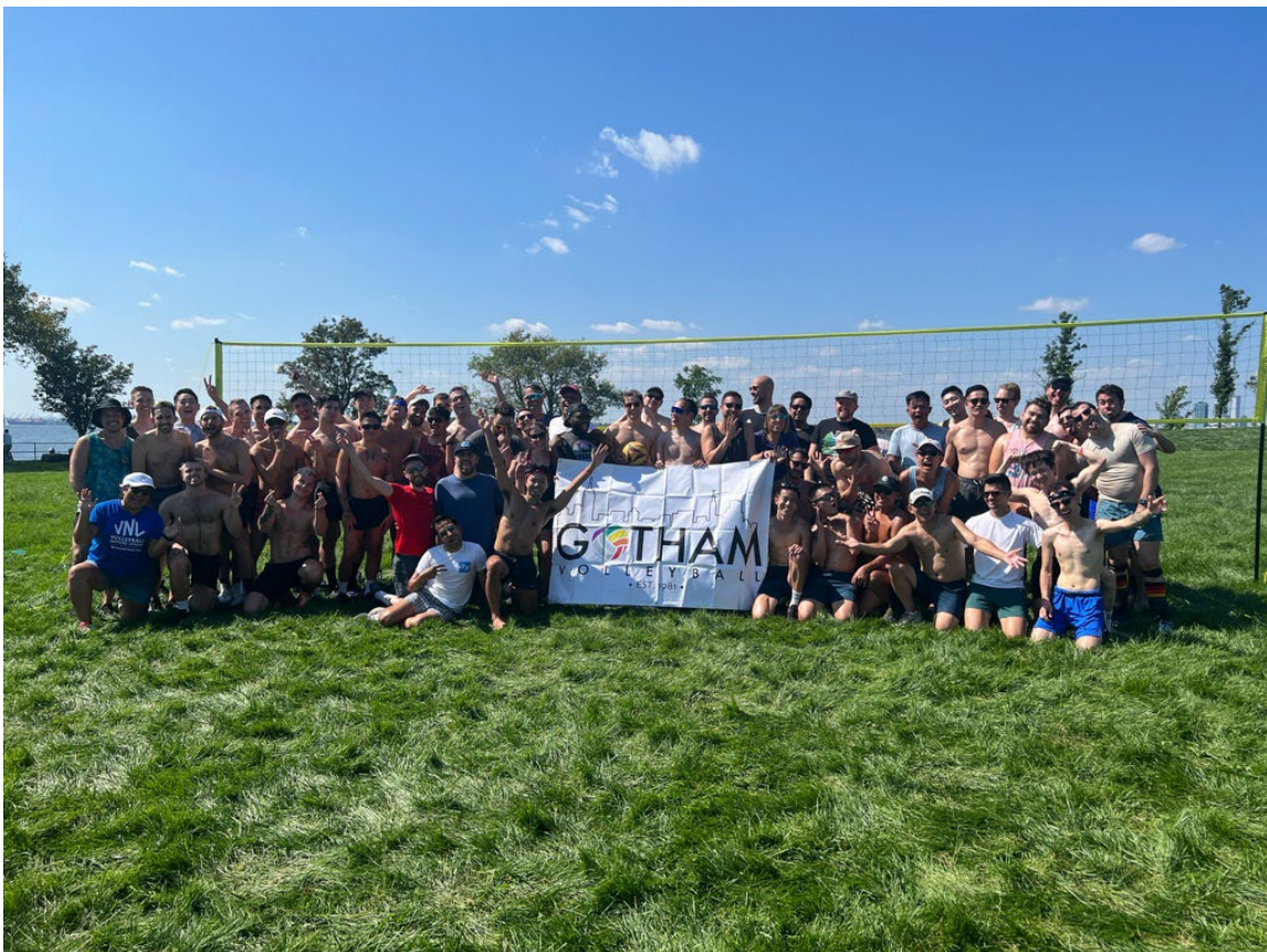
Members enjoying just a few of the events that A&O helped spearhead throughout the year.