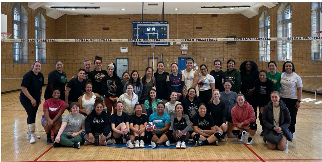
WOMEN'S MIXER TOURNAMENT 2024