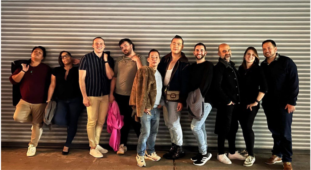
DIVISION PLAY LEADERSHIP GROUP serving in more than one way at a group meeting in November 2023