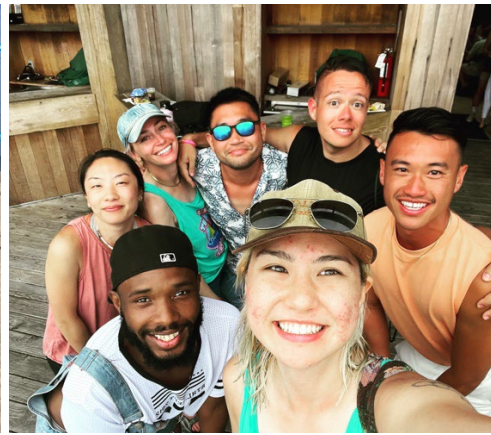
FIRE ISLAND TOURNAMENT 2023