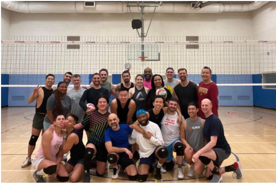
September 2023, Gotham Leadership partaking in an Open Play at Howe to celebrate the end of a successful tryouts season..