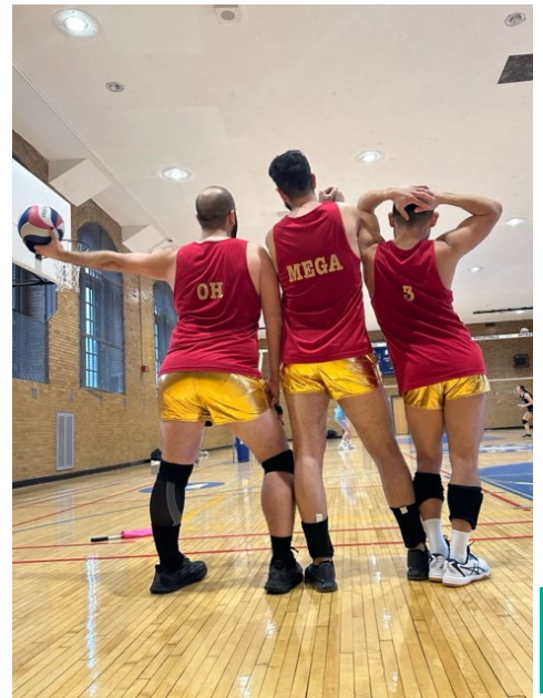
GOTHAM CARES MIXER 2023