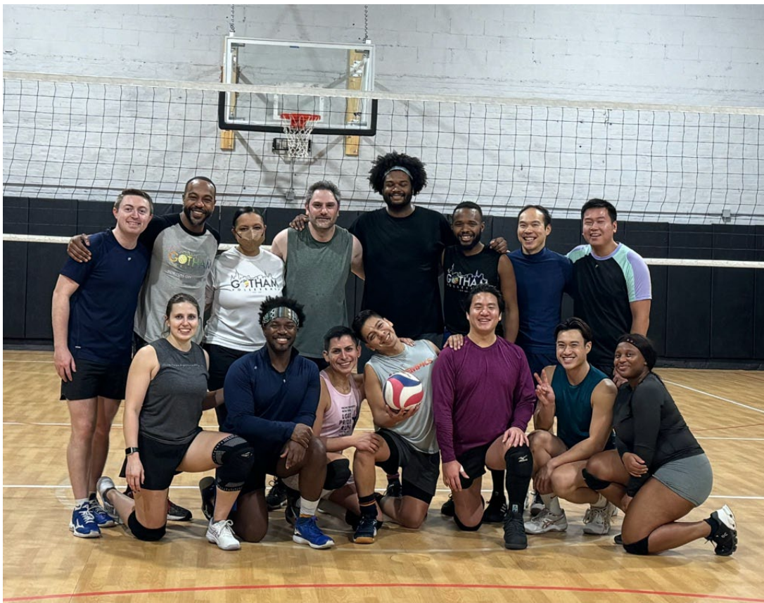
February 2024, Gotham Leadership takes to the court to try out our new location, The Post BK.